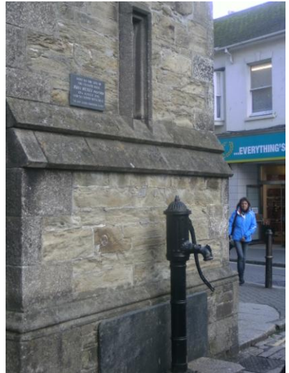
The photos are from Truro, in Cornwall.

If you are a reader of the diaries of famous people, then you could buy no better diary to read in the New Year than that of John Wesley!