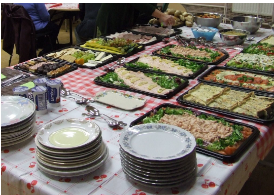
The Buffet Table

Also to help us understand the various stages in the translation of the Bible into English, were a series of illustrated display panels loaned by Carlisle Cathedral.