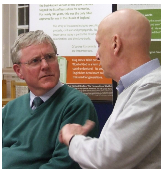
A Thoughtful Moment!