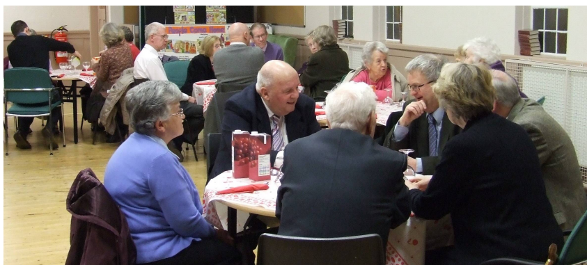
Talk at the Tables