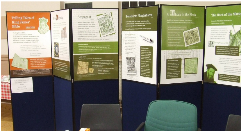
Some of the Carlisle Cathedral KJV Display Panels